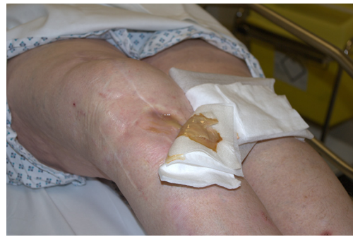
Figure 3 Case with an anterior sinus.

There are a small number of reports detailing ‘2-in-1’ stage procedures, with a series from Parkinson et al. (22) describing 12 cases managed using this method with no cases reporting recurrent infection at a minimum of 2 years post procedure. It is of interest that 2 cases included in this series had an actively discharging sinus pre-operatively, which is commonly cited as a contra-indication to one-stage revision. Although this is a small series and caution should be exercised in extrapolating the results, it raises the point that a patient with deep infection and a solitary sinus, may be safely treated with a single stage procedure if the sinus can be fully excised along with the initial debridement. A further study reported a series of 25 patients (26) followed up to between 2–8.5 yrs reported an eradication rate of 96%. This series involved the use of uncemented metaphyseal sleeves in the reconstruction of significant bone defects associated with deep infection (Figure 2). Similar to the preceding study, this one included six patients with a draining sinus pre-operatively (Figure 3), although all were through or adjacent to the original incision. The successful