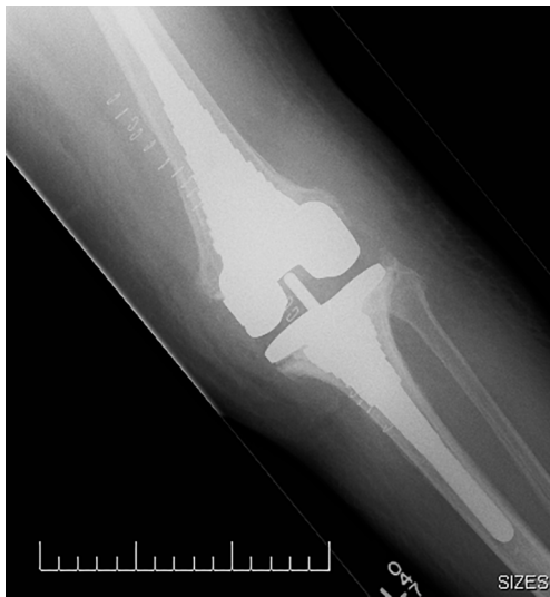
Figure 2 Reconstruction of associated bone defects with metaphyseal sleeves.

reviews and meta-analysis (18,24,25) reporting published results for single stage to be between 86–100% and 66–95% for two stage procedures. It is important to note that patients undergoing one-stage revisions are likely to be pre-selected on the basis of the MSIS criteria (19) and many two-stage procedures may not be suitable for a single stage procedure. This is likely to affect the results of two stage and should be considered when comparing the results.